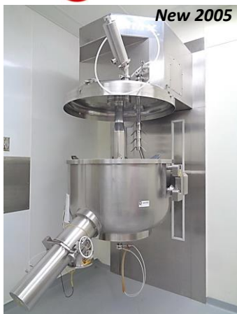
Vector 600 Liter High Shear Granulator, Model GMX-600 Lot 1