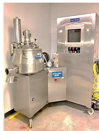
Fluid Air 100 Liter High Shear Granulator, Model PX100 Lot 104