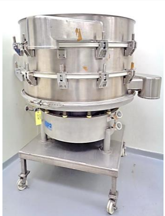
QTY (4) Sweco 18", 30" & 60" Sifters View of Lot 51