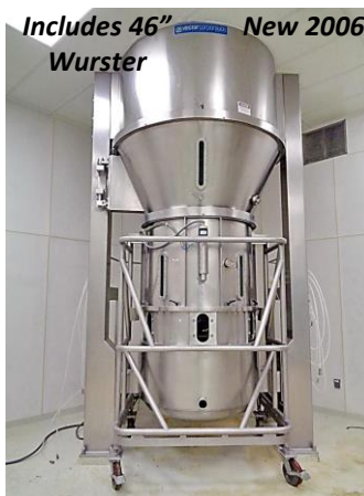
Vector Fluid Bed Dryer, Model FL-M-300 Lot 2