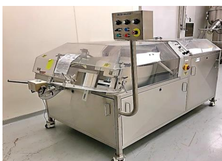
Kalish Kalisort Random Bottle Unscrambler, Model 7400 Lot 165