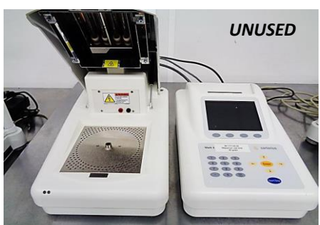
Sartorius Moisture Balance, Model Mark 3 Lot 302