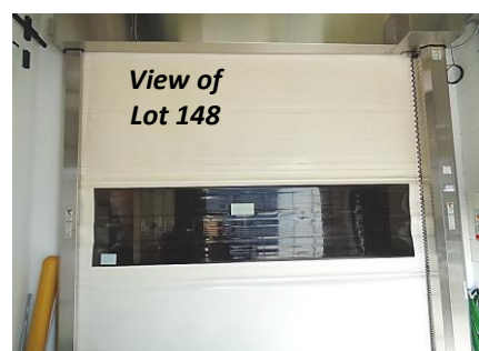
QTY of ASI and Stanley Quick Acting Roll Up Doors & Automatic Sliding Suite Doors