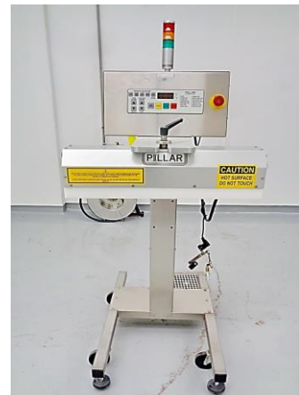
Pillar Induction Cap Sealer, Model Unifoiler Lot 166