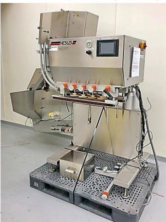
QTY (5) Aesus 6 and 8 Quill Cappers & Retorquers Lots 152, 157, 158, 159 & 161