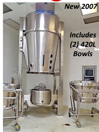
Vector Fluid Bed Dryer, Model VFC-120M Lot 99