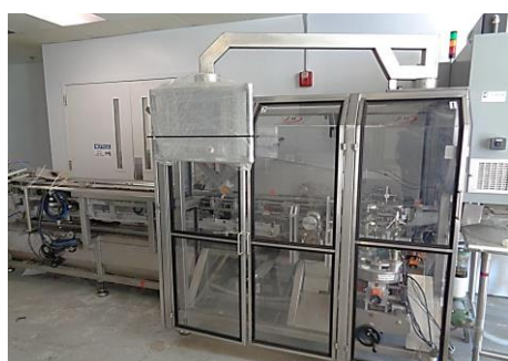
ZAC (Z Automation Company) Vertical Intermittent Cartoner, Model CV7.5 Lot 194