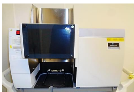
Perkin Elmer Atomic Absorption Spectrometer Lot 335