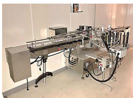
Quadrel Pressure Sensitive Labeler, Model Versaline Lot 192