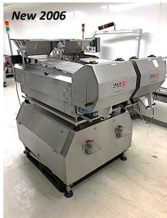
Swiftpack 24 Lane Channel Counter Lot 190