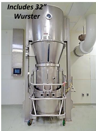
Vector Fluid Bed Dryer, Model FL-N-120 Lot 109