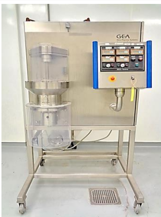
GEA/Niro/Aeromatic-Fielder Extruder, Model E-140 Lot 85