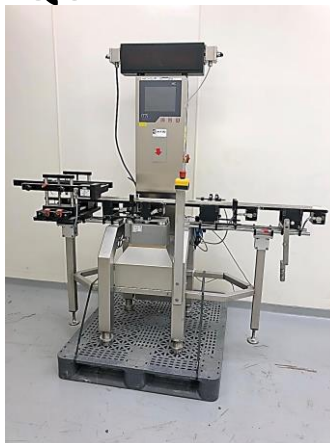
QTY (5) OSC and Loma Checkweighers View of Lot 162